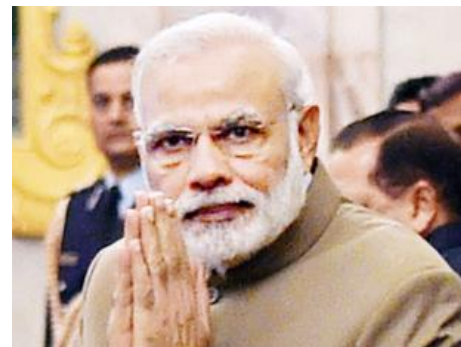
Govt to move a Cabinet note proposing major changes in PEO's structure and function to suit the current needs of evaluation in line with global norms

Monitoring and evaluation are the key mandates of the recently created National Institution for Transforming India (NITI Aayog), and official sources in the Aayog told ET that the government will soon move a Cabinet note proposing sweeping changes in the structure and function of the PEO to suit the current requirements of evaluation, much in line with international standards. The main changes could include the way evaluations are done besides getting domain experts to evaluate these programmes.