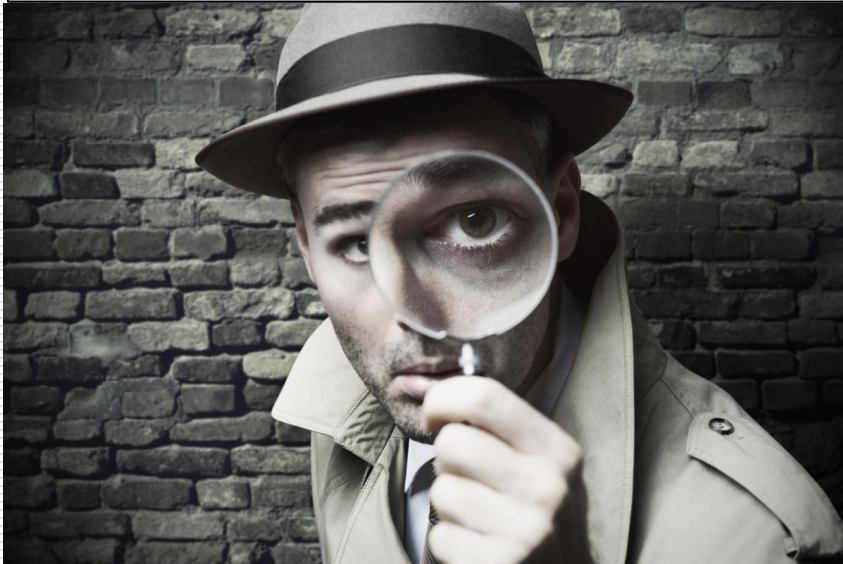
IT - DEPARTMENT