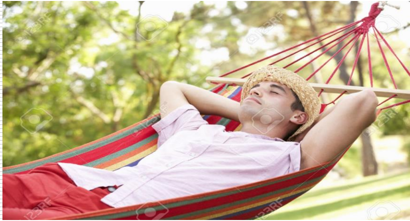
Assessee / Tax Payer