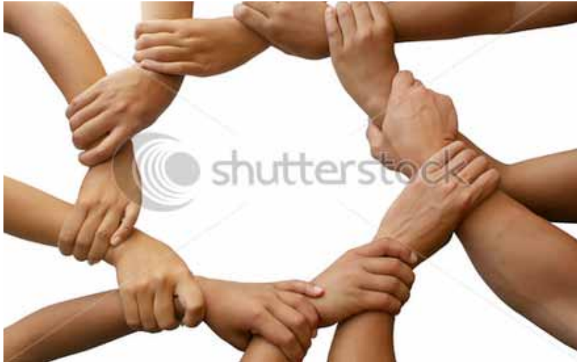
The Members of ICAI have to undergo mandatory training of 10 hours every year.

A MEMBERSHIP HELPS IN STAYING IN TOUCH WITH THE INDUSTRY STANDARDS AND STAY IN TOUCH WITH PEERS