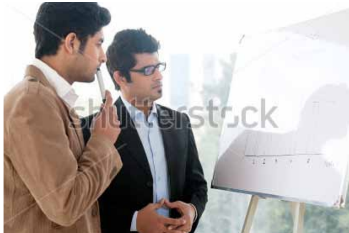
The Quality Board has so far released 14 Cost Accounting Standards.

IN ORDER TO MAINTAIN A CERTAIN STANDARD OF THE INSTITUTE, A QUALITY REVIEW BOARD MEETS UP REGULARLY