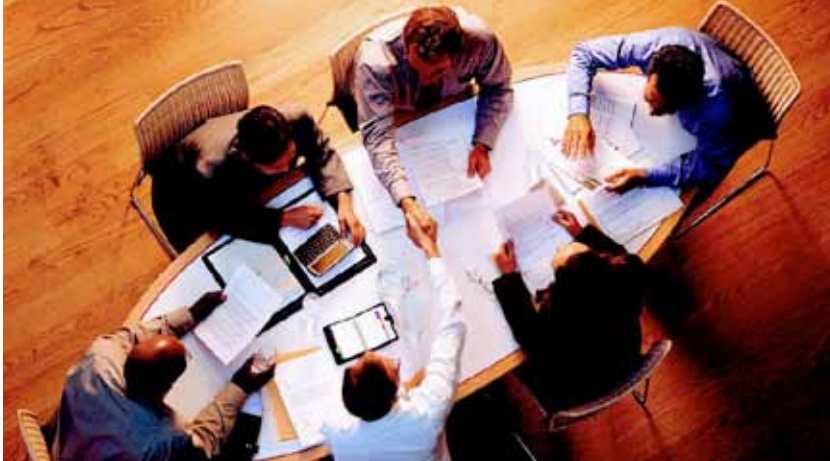
A CMA is driving force of management as well as key consultant, auditor and advisor in practice.

AN APPROPRIATE MANAGEMENT ACCOUNTING SYSTEM IS ESSENTIAL FOR ALL BUSINESSES TO MAKE VENTURES PROFITABLE IN SHORT & LONG TERM