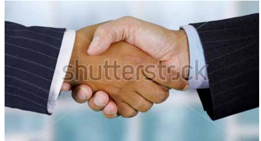
The MoUs with CMA bodies in UK, USA & Australia will help CMAs from India gain global recognition.

THE INSTITUTE HAS SIGNED MOUS WITH CIMA, UK, IMA, USA, NIA, AUSTRALIA AND CISI, UK AS WELL AS WITH IGNOU AND CBEC