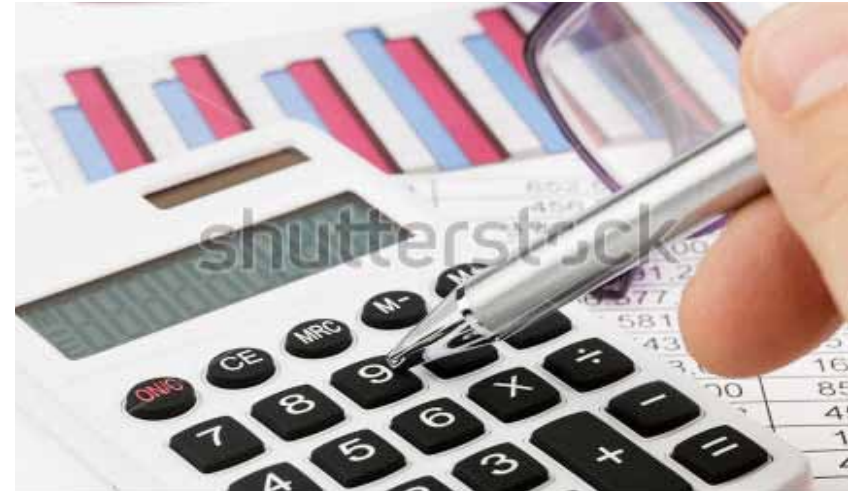
A Cost Accountant carries out costing and pricing of goods and services as well as carries out the verification of cost accounting and related statements

A COST ACCOUNTANT PLANS, MONITORS AND CONTROLS THE COST AND PRICE OF A PRODUCT OR A SERVICE.