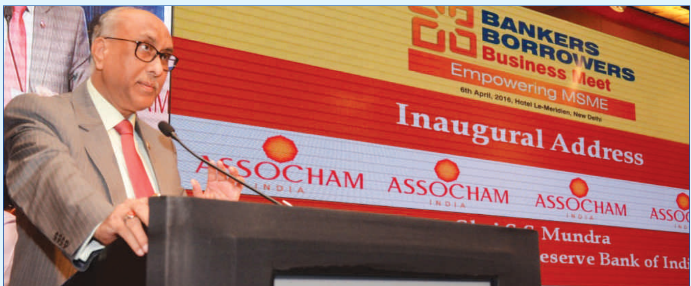
Shri S.S. Mundra addressing the Inaugural Session