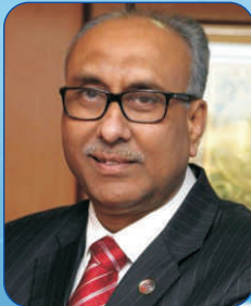
Shri S.S. Mundra Deputy Governor Reserve Bank of India