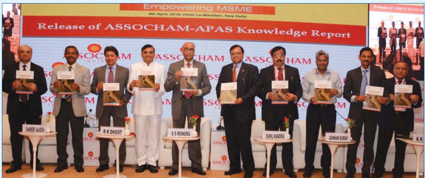
Release of ASSOCHAM-APAS Knowledge Report