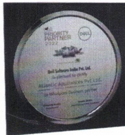
Memento 2 nd