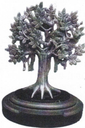
Memento 1 st