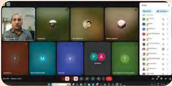
Hardwar Rishikesh Chapter