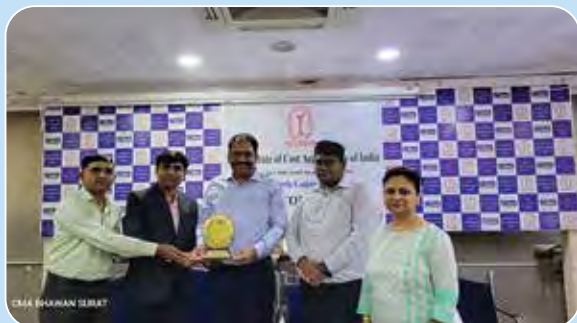
Surat-South Gujarat Chapter