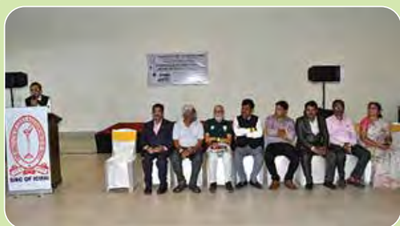
Southern India Regional Council