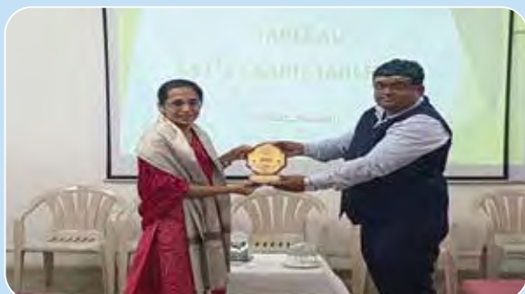
Pimpri Chinchwad Chapter