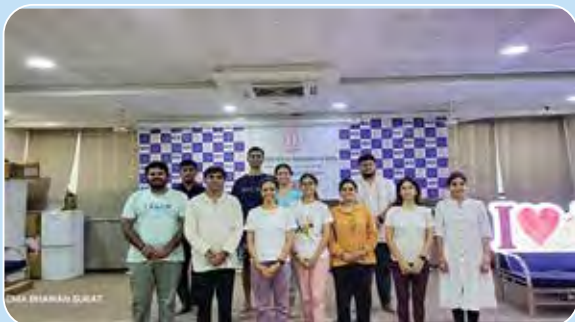
Surat-South Gujarat Chapter