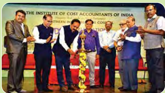
Southern India Regional Council