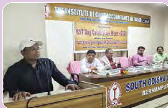
South Odisha Chapter