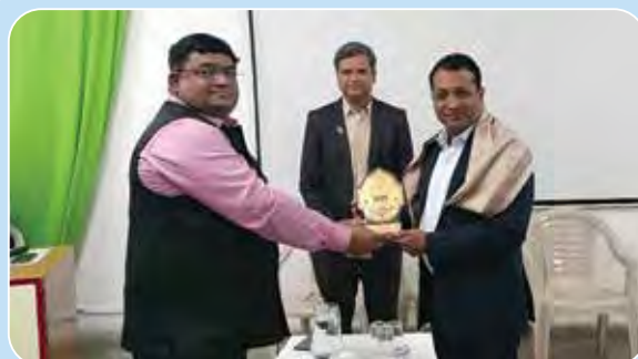
Pimpri Chinchwad Chapter