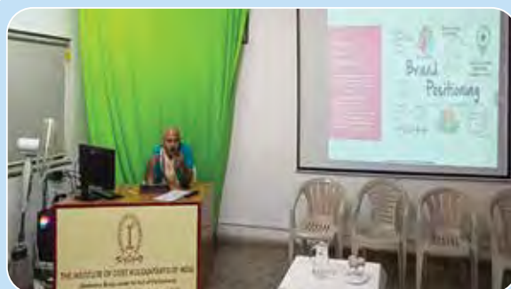
Pimpri Chinchwad Chapter