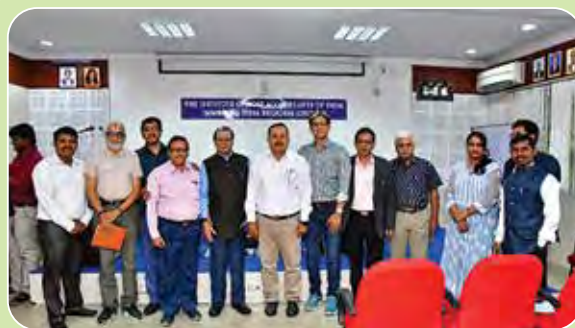
Southern India Regional Council