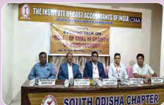
South Odisha Chapter