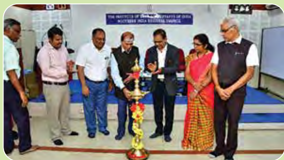
Southern India Regional Council