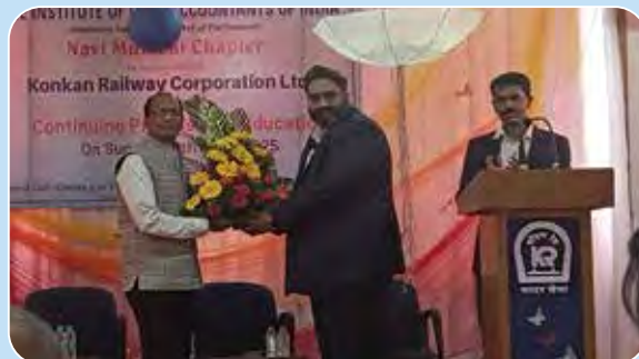
Navi Mumbai Chapter