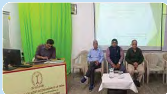
Pimpri Chinchwad Chapter