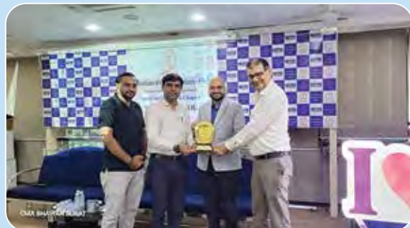
Surat-South Gujarat Chapter