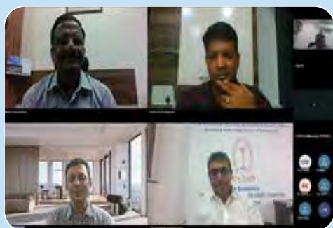
Pimpri Chinchwad Chapter