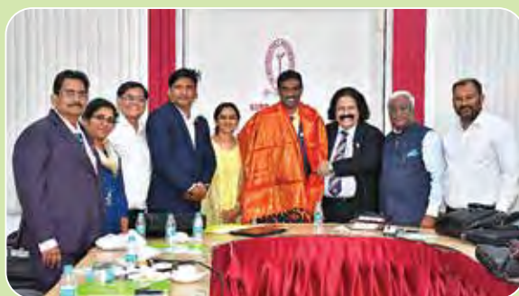
Southern India Regional Council