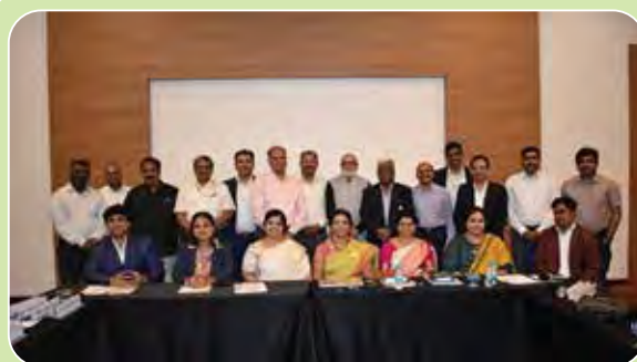
Southern India Regional Council