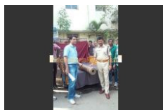
17th Century Antique