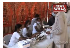
Swine Flu health camp organized in Chelapura, Hyderabad