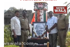
Republic Day 2015 celebration at Dabirpura Police station, Hyderabad