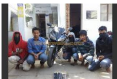
6 member gang of