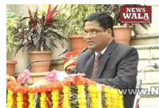
Republic Day 2015 celebration at High court Hyderabad