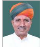
Shri Arjun Ram Meghwal Hon'ble Union Minister of State for Finance & Corporate Affairs