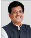
Shri Piyush Goyal Hon'ble Union Minister of State for New & Renewable Energy Power and Coal