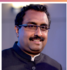
Shri Ram Madhav National General Secretary Bharatiya Janata Party