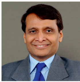
Shri Suresh Prabhu Hon'ble MP-Rajya Sabha & India's Sherpa for G20 & G7 Nations