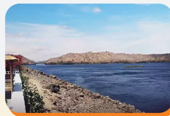
Panchmuli Lake (1.9 KM)