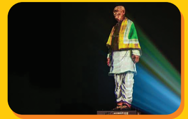
Laser show at the Statue of Unity