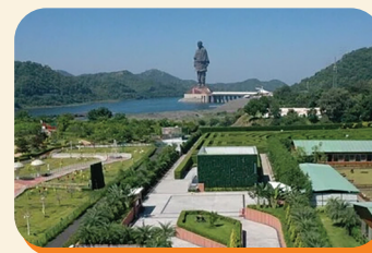
Maze Garden (4.7 KM)