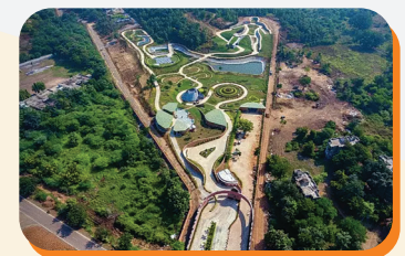
Arogya Van or Herbal Garden (10 KM)