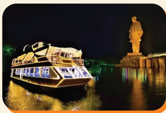
Boat Rides at Statue of Unity (6.4 KM)