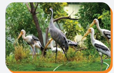
Geodesic Aviary Domes (3.3 KM)