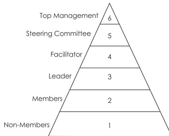
Fig: 1 Structure quality circle

Top management plays an important role in ensuring the success of implementation of quality circles in the organization.