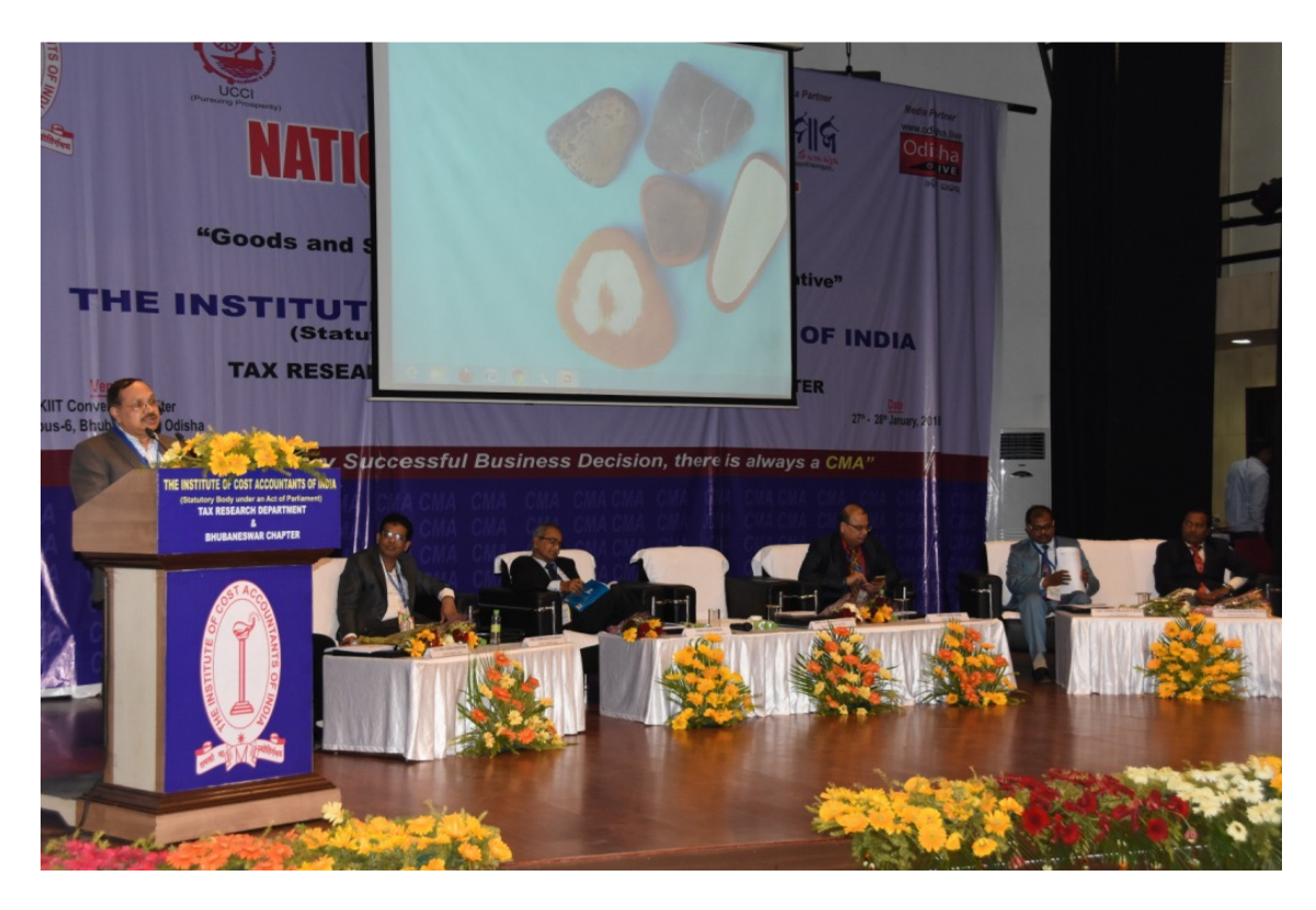
Technical Session – III