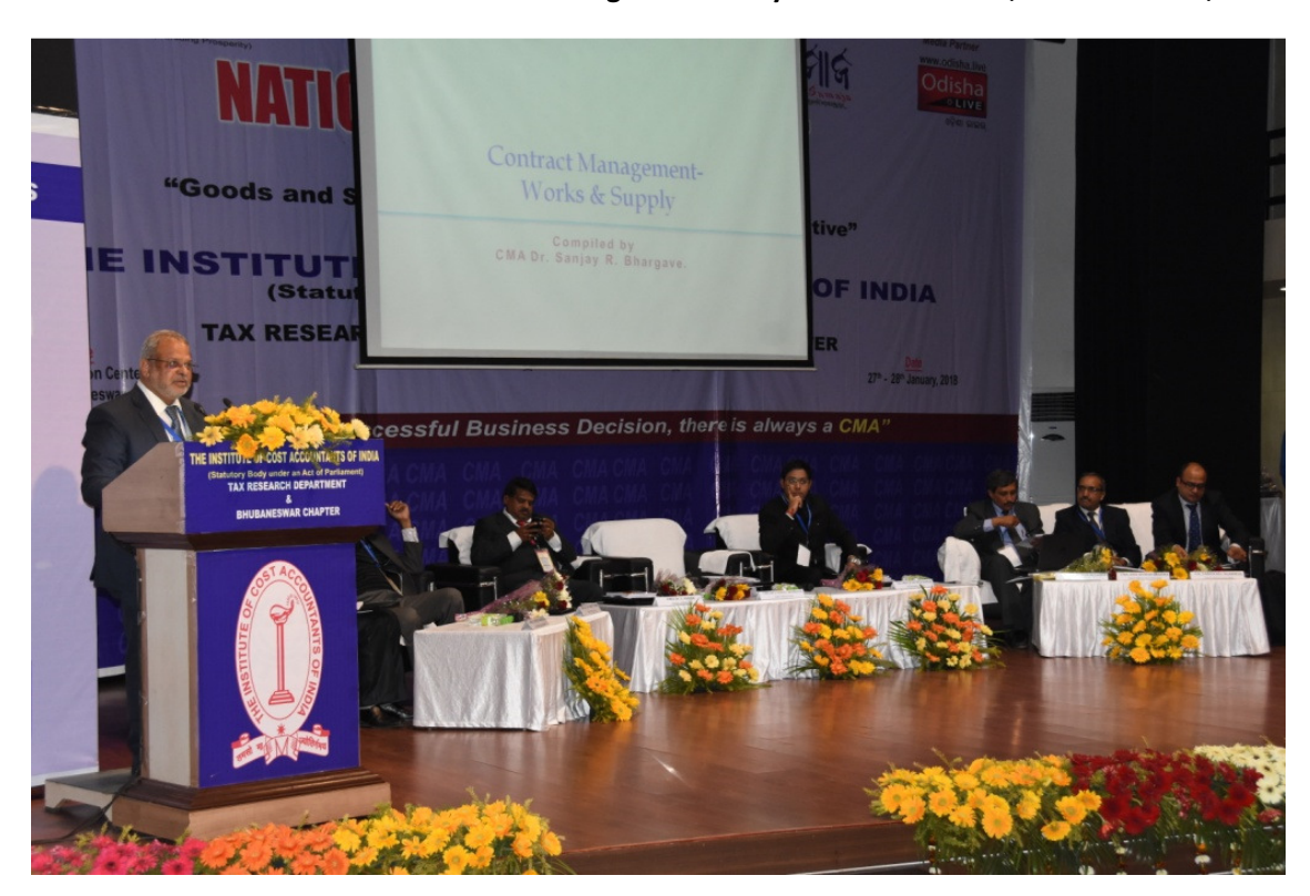
Technical Session - II