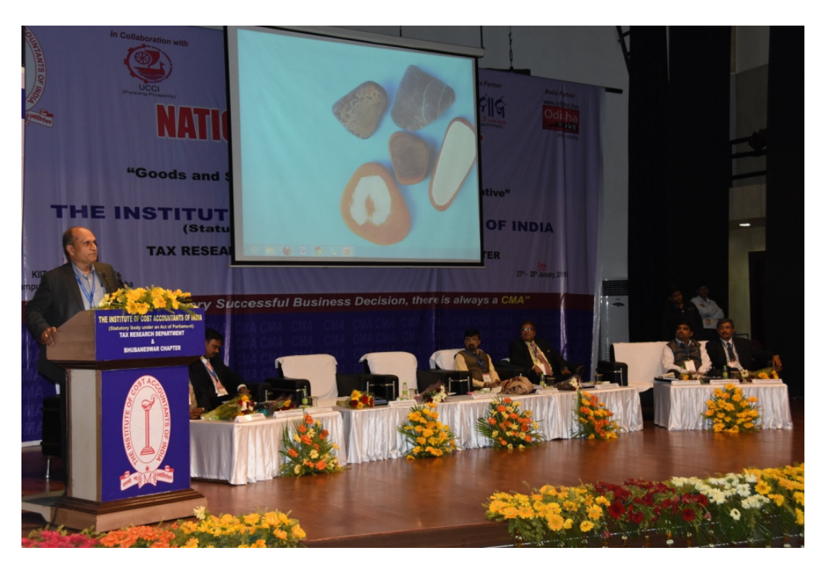
Technical Session – IV