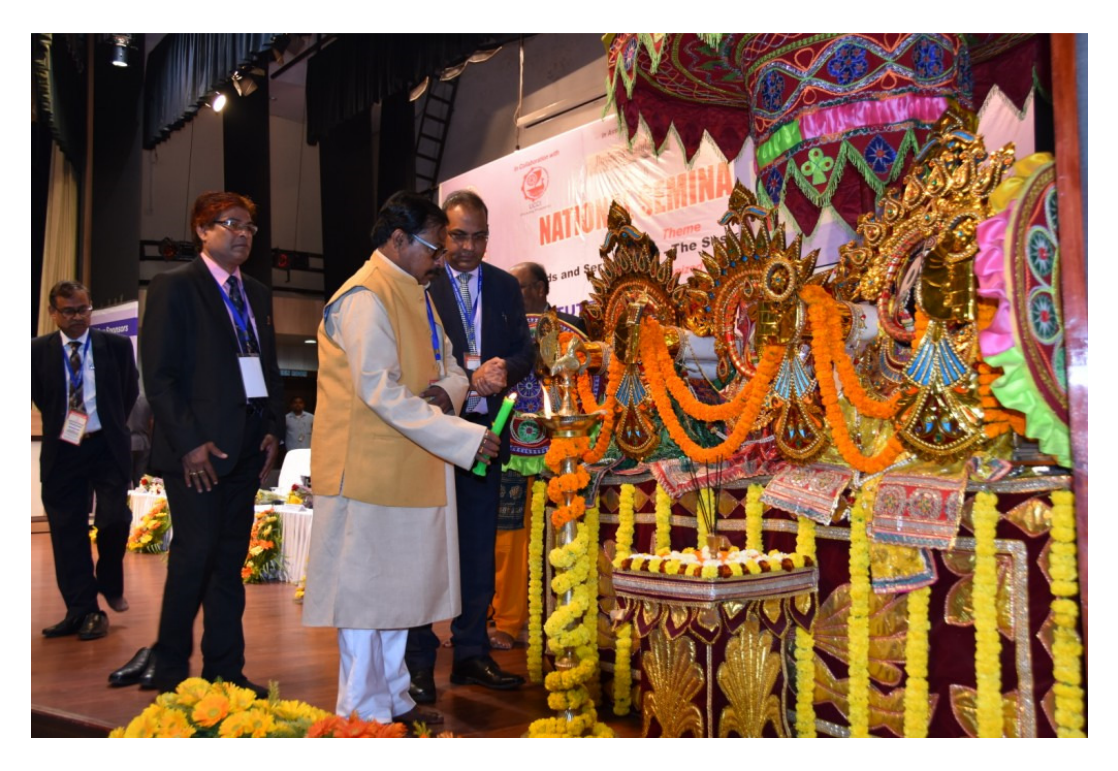
Lighting of the lamp by Shri Shashi Bhusan Behera , Ho'ble Cabinet Minister (Finance, Excise & PE), Govt. of Odisha.