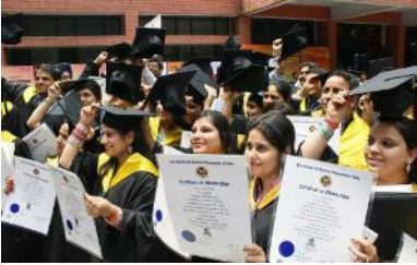
A new agreement signed today by ACCA (the Association of Chartered Certified Accountants) and The Institute of Cost Accountants of India (ICAI) will see them work in partnership to develop the business and finance profession in India.