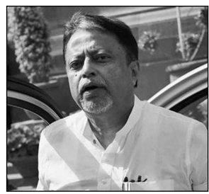
voting takes place," BJP leader Mukul Roy said.

"According to the norms of election commission of India, we want Central paramilitary forces to be deployed in all the booths of Sabang constituency. Democracy is under threat and TMC has let loose a reign of terror. It is the duty of the election commission to ensure that free and fair